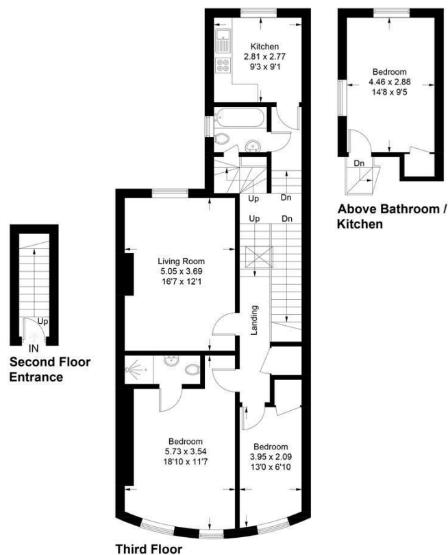
Illustration for identification purposes only, measurements are approximate, not to scale. Fourlabs.co © (ID1267115)

Approximate Gross Internal Area = 98.6 sq m / 1061 sq ft